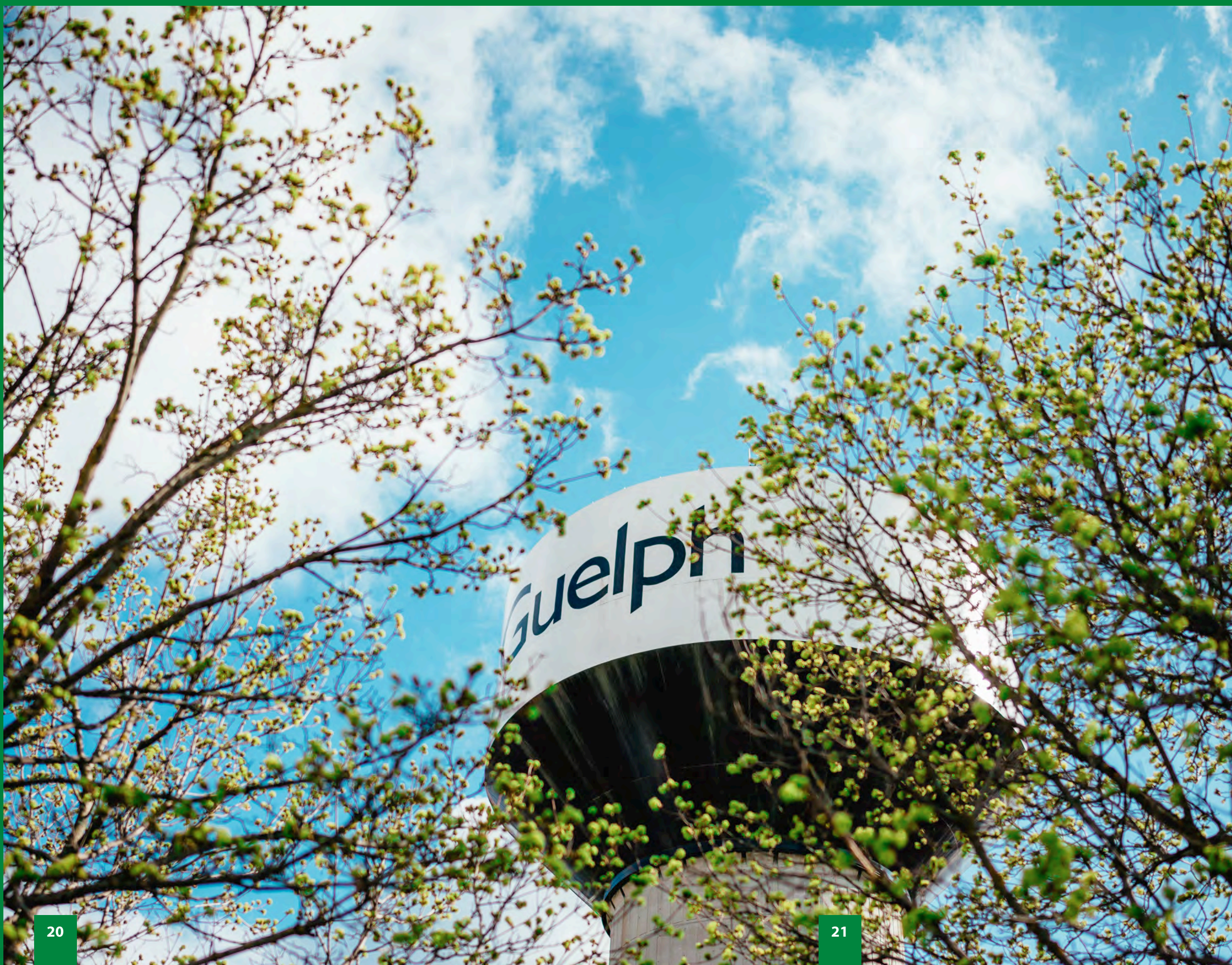
📍 Water tower on Clair Road

Empower the community to help create a sustainable city