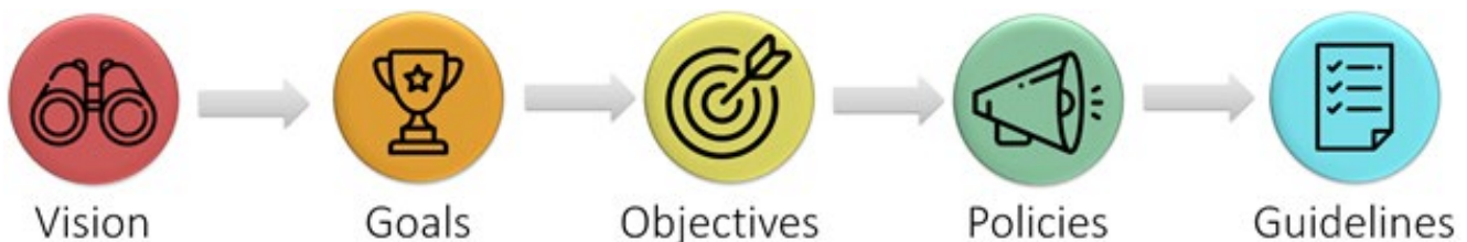
Figure 1: Components of a Comprehensive Policy Framework for Municipalities

Objectives are the more “drilled down” actions and targets of a particular goal. Objectives allow municipalities to track progress towards those targets and know when they are met.