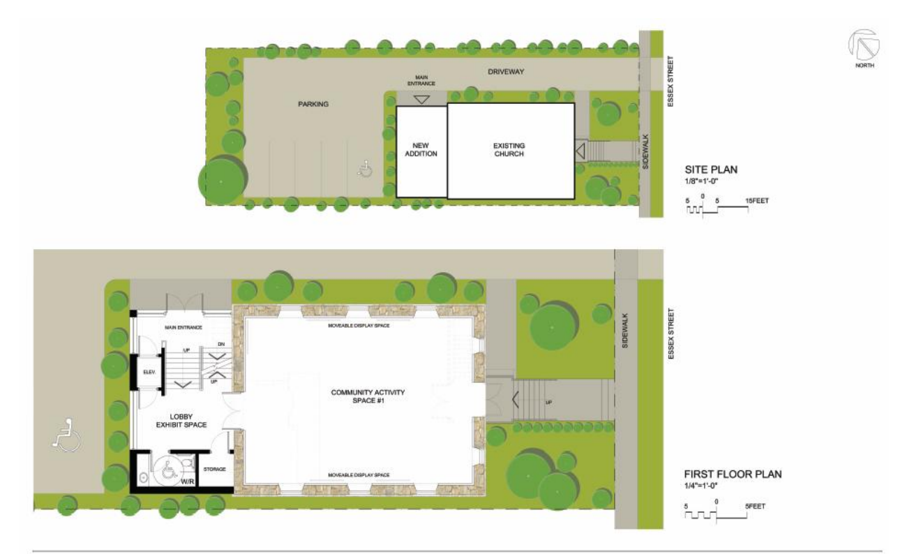
BME: UNDERGROUND RAILROAD SPIRITUAL & CULTURAL CENTER 83 Essex Street, Guelph, ON