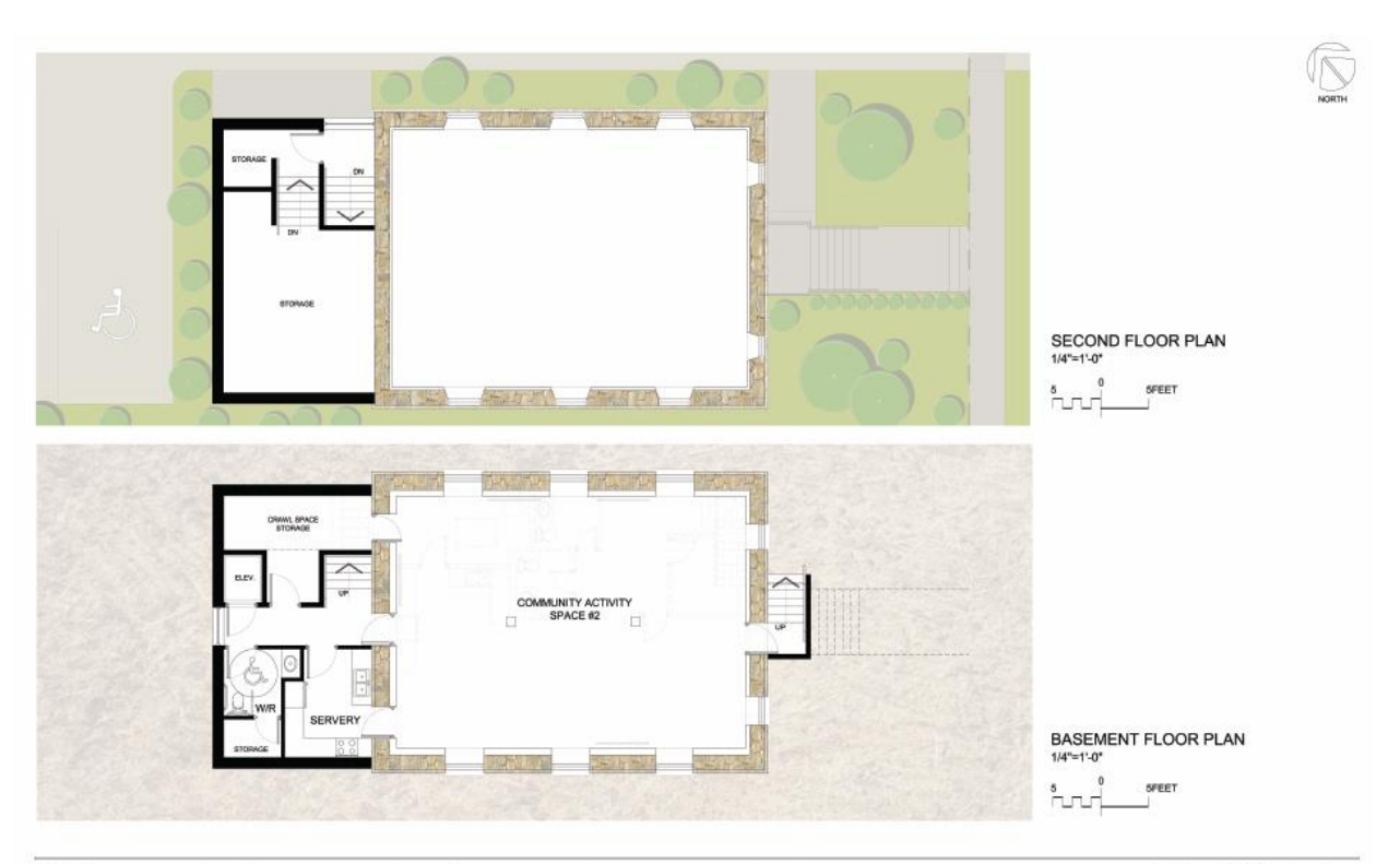
BME: UNDERGROUND RAILROAD SPIRITUAL & CULTURAL CENTER 83 Essex Street, Gueiph, ON