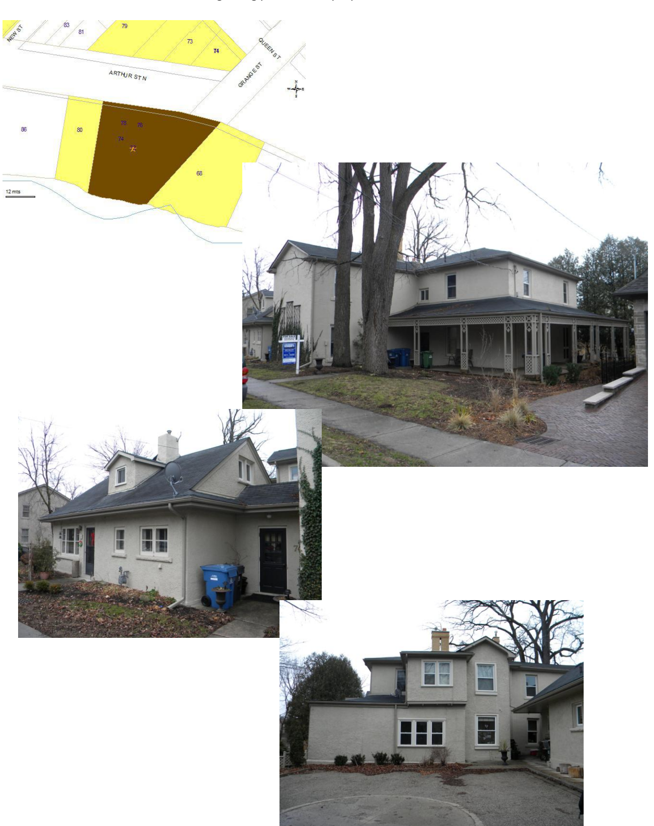
1tem 6.2 75 Arthur Street North "Mavis Bank" (designated heritage property) Discussion regarding potential for proposed alterations.