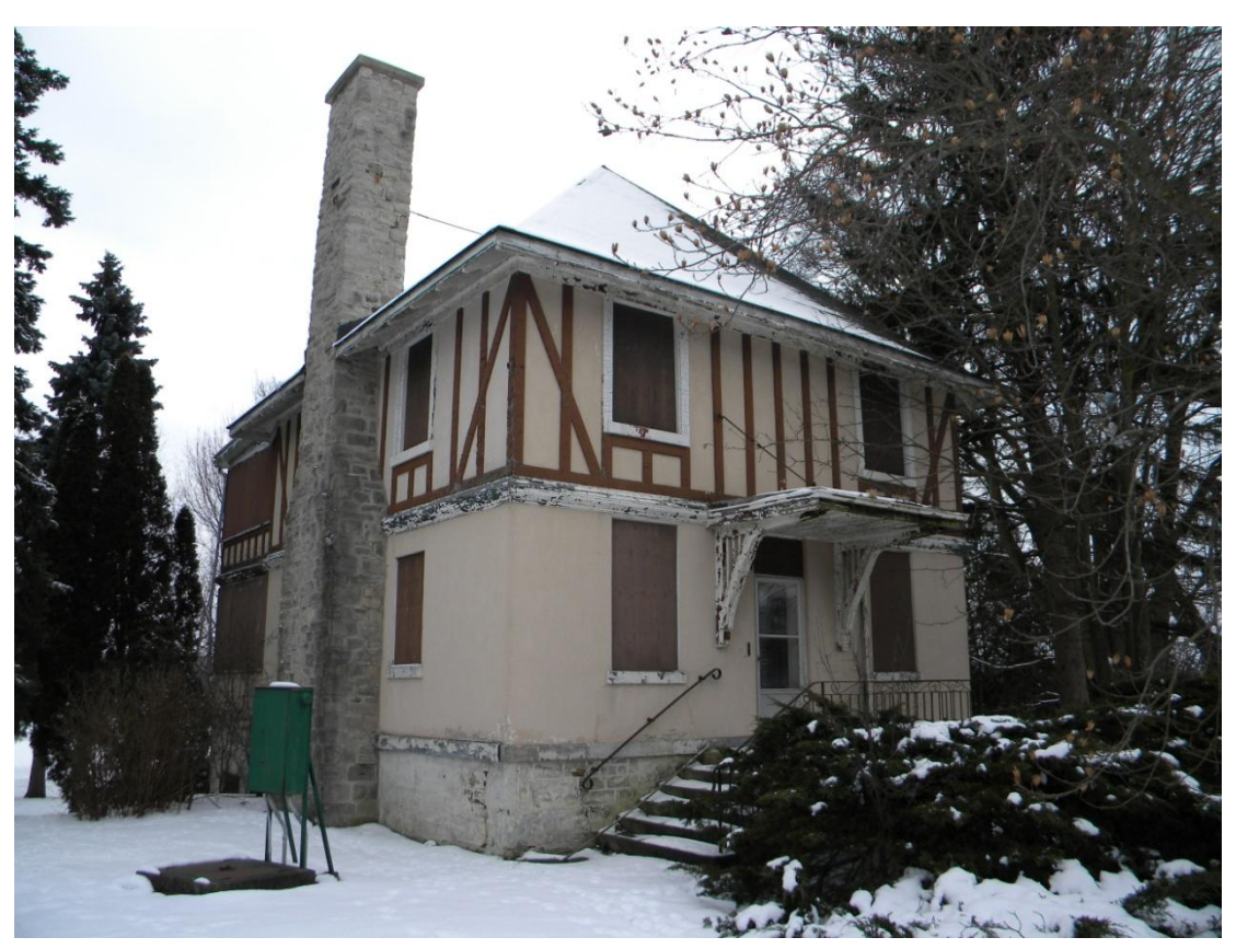
185 York Road, "Willowbank Hall" (listed as non-designated property) Staff update on recent site visit.