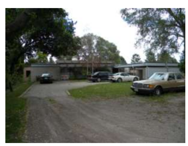
Item 6.3 5 Arthur Street South